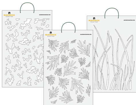
Three 18" x 28" Stencils